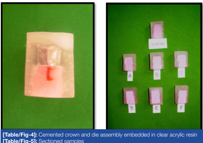
(able/rig-o): Section led samples Group A-Ninety degree shoulder, Group B- Rounded shoulder Group, C-45 degree sloped shoulder, Group D- Chamfer, Group E- Long chamfer, Group F-Feather edge)

The sectioned halves were focused under a stereomicroscope and the cement spaces were measured to the nearest micron. The cement thickness was measured at two points on the occlusal surface and one at each margin [Table/Fig-5].